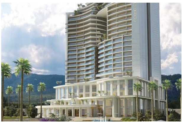
Building: Araz Hotel Country: Iran

City: San Francisco, CA Units: 8 (American VENTUS)