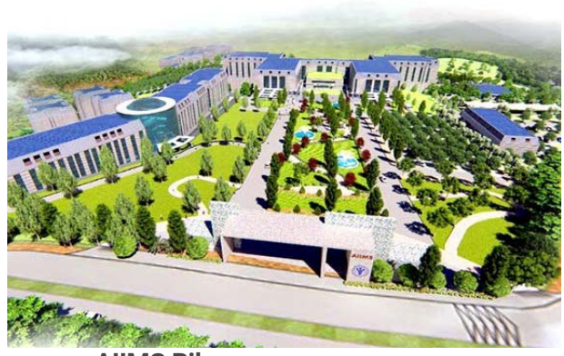
Building: AIIMS Bilaspur, Country: India

City: Himachal Pradesh, Units: 130 ( VENTUS VVS)