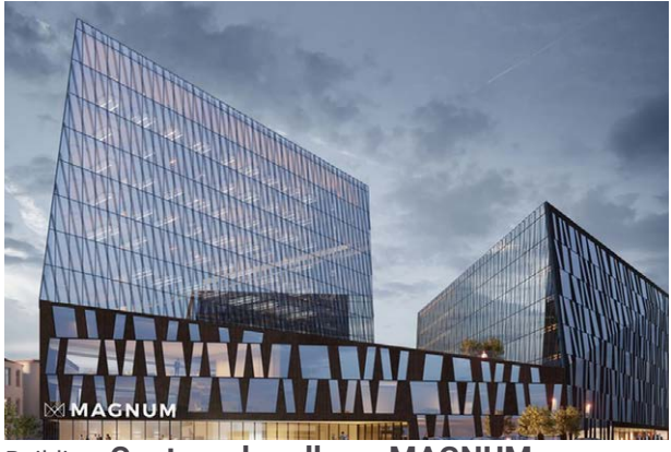
Building: Centrum handlowe MAGNUM