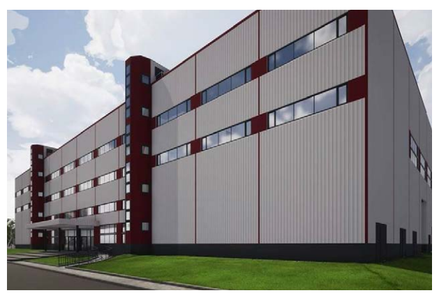
Building: Łotewskie Archiwum Państwowe

Country: Latvia City: Riga Units: 22 (VENTUS VVS)