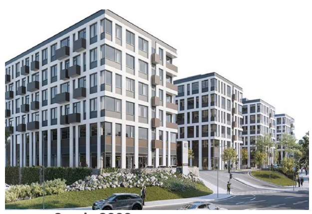
Building: Omnia 2000 Country: Czech Republic

City: Himachal Pradesh, Units: 130 ( VENTUS VVS)