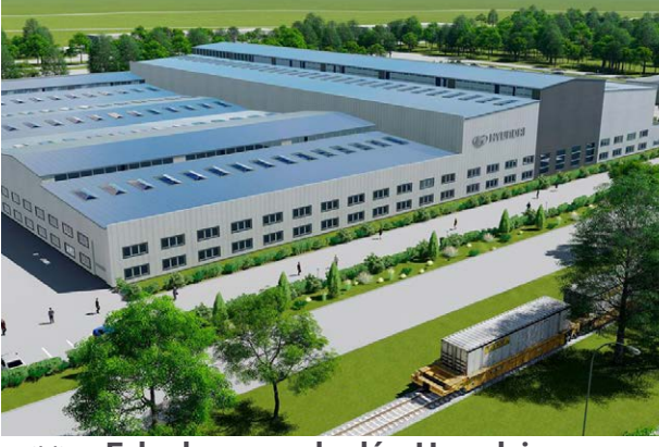
Building: Fabryka samochodów Hyundai Country: Kazakhstan