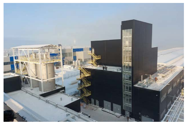
Building: Alabuga-Fiber plant Country: Russia City: Elabuga Units: 62 (VENTUS VVS)

Country: Latvia City: Riga Units: 22 (VENTUS VVS)