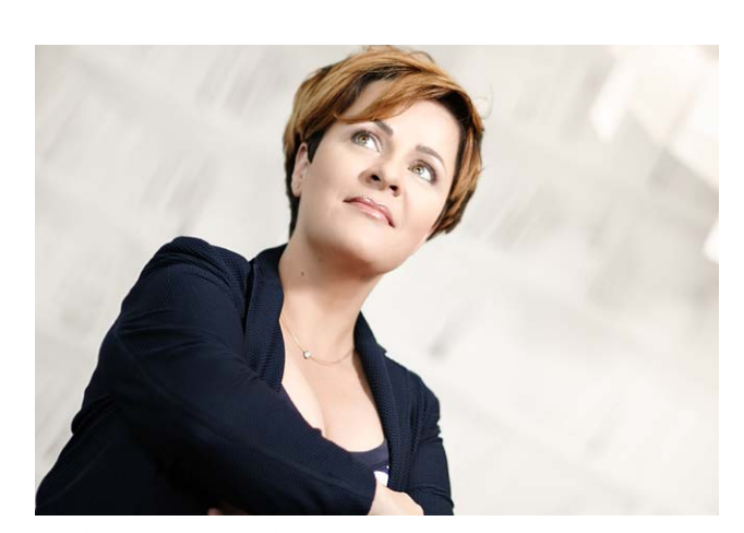
Ladies and gentlemen,

I invite you to read this year's last edition of our corporate newsletter.