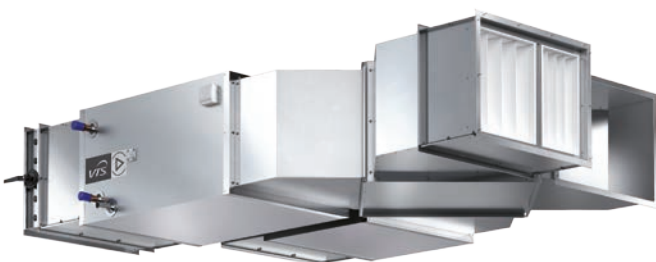
VENTUS N-TYPE Air handling unit