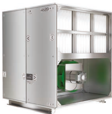
VENTUS COMPACT Air handling unit