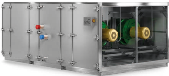
AMERICAN VENTUS Air handling unit