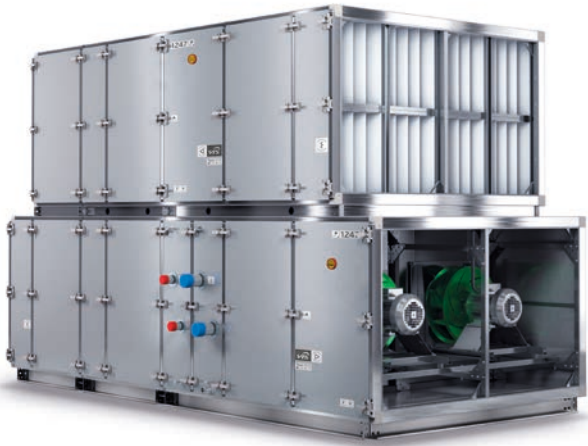
VENTUS Air handling unit